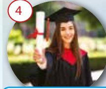
receive a diploma