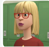
Martha's Favourite Lesson